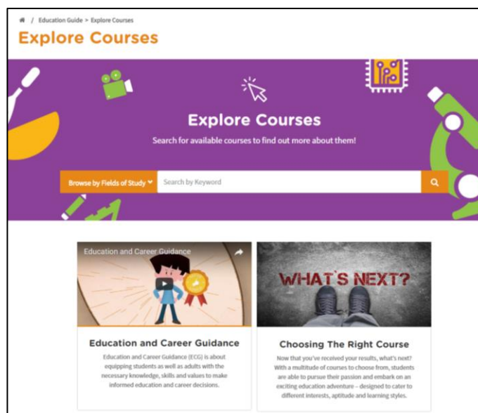
Figure 1-3: Explore Courses (Education Guide)