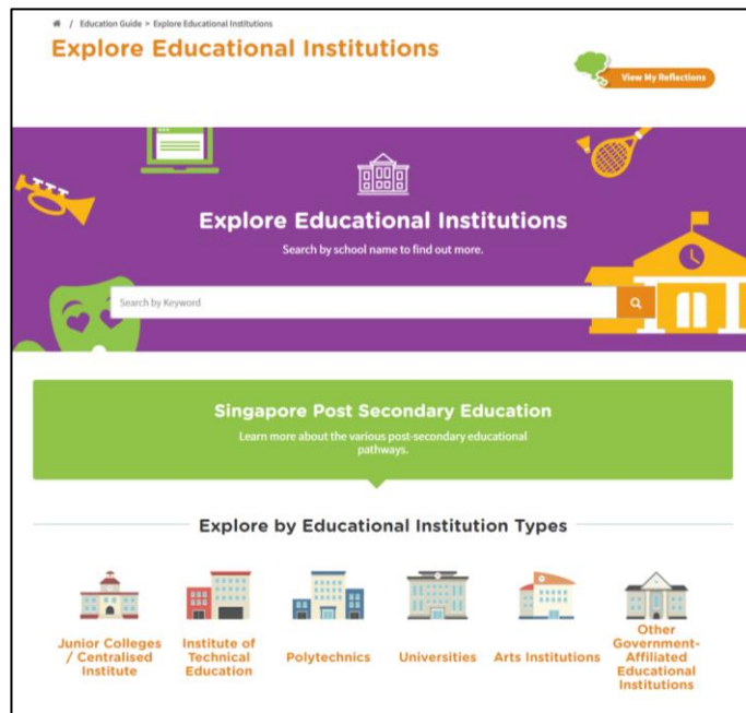
Figure 1-2: Explore Educational Institutions (Education Guide)