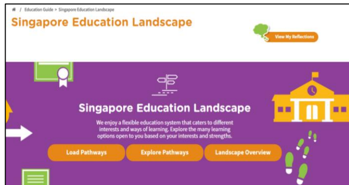
Figure 1-1: Singapore Education Landscape (Education Guide)